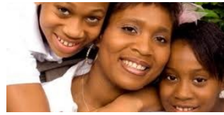
Recovery Month Celebration